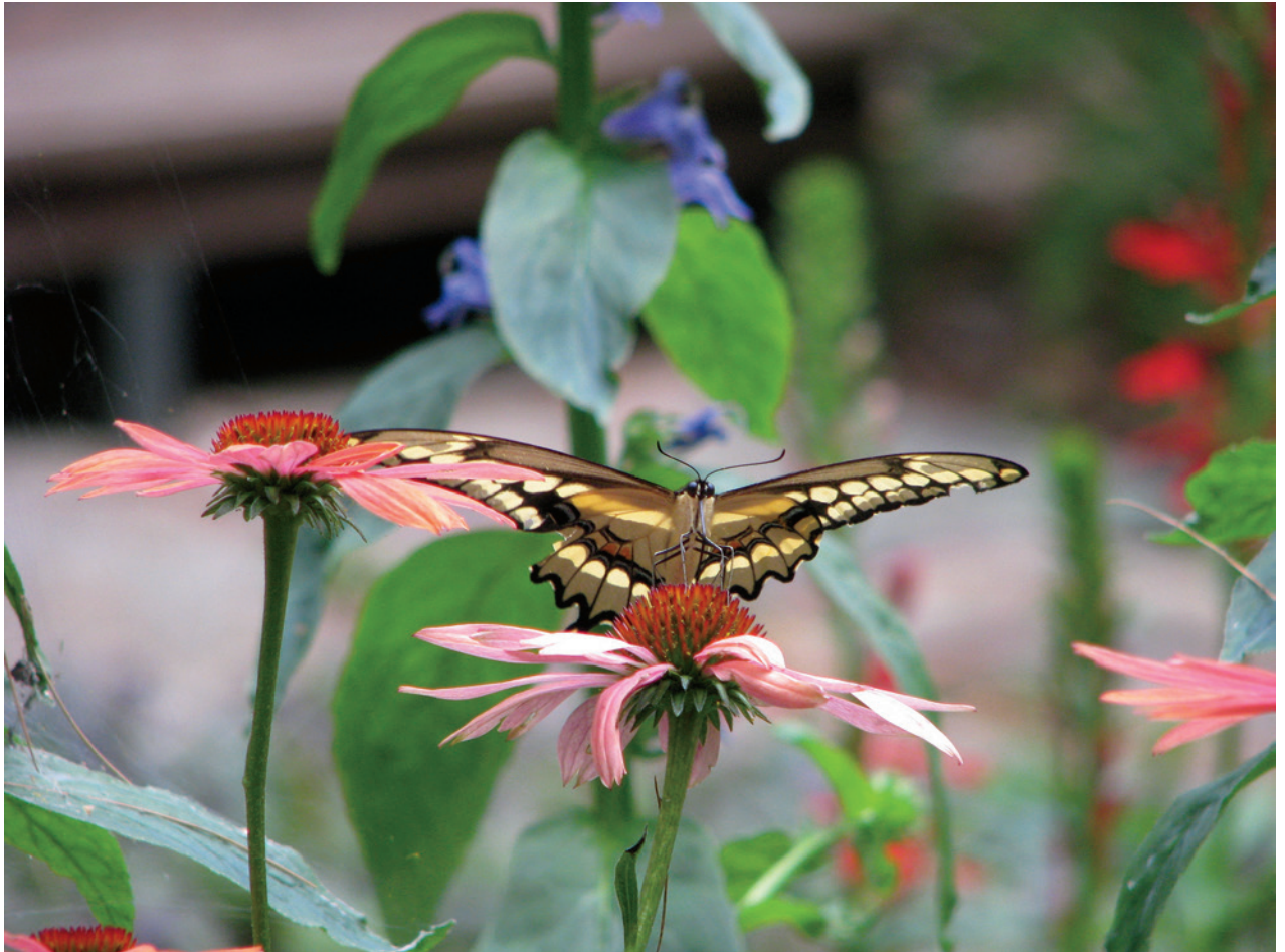
Giant Swallowtail Butterfly, Squam Lake, New Hampshire

Copyright © 2016 Massachusetts Medical Society.